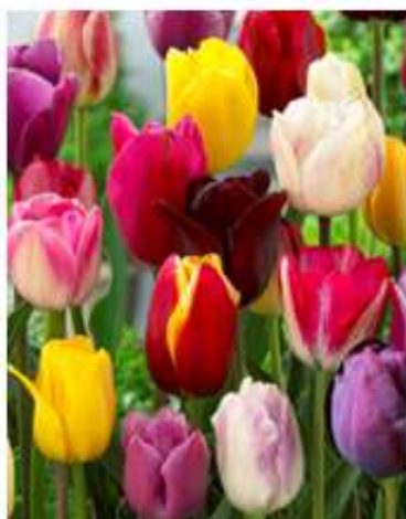
Tulips - Mixed