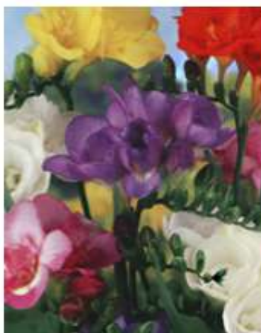
Freesias - Single and Double