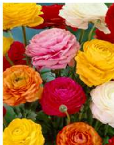
Ranunculus - Mixed