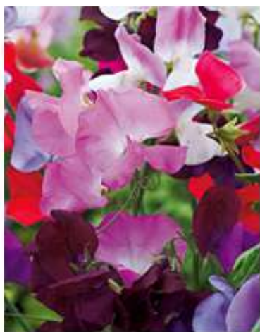
Sweet Pea - Early Multiflora