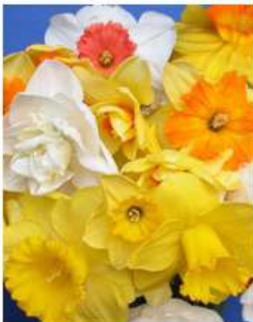
Daffodils - Mixed