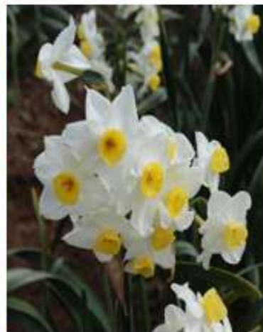
Daffodil - "Grand Monarch"