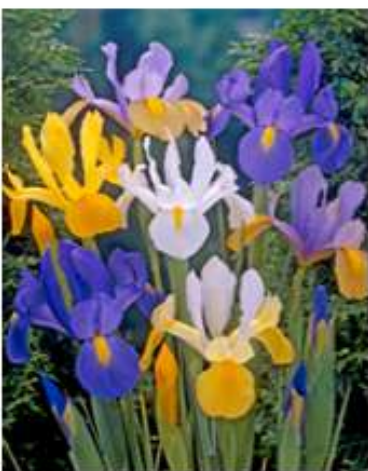
Dutch Iris - Mixed