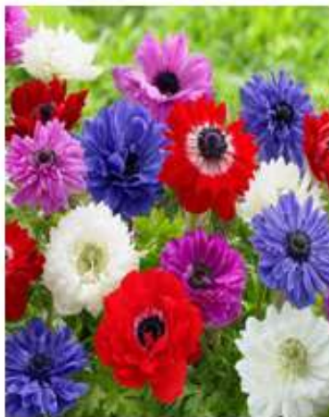
Anemone St Brigid (Doubles)