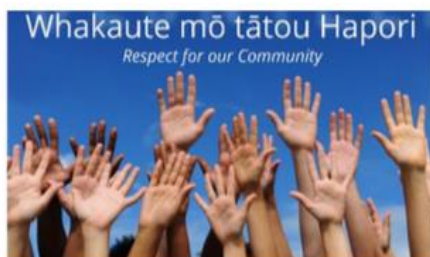
Respect for our community