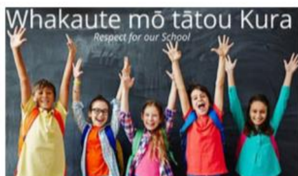
Respect for our school