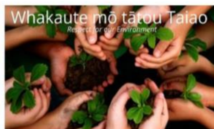
Respect for our environment

Your Kiwi Can Leaders will run a variety of activities using different teaching techniques to cover the term's learning intentions, such as: